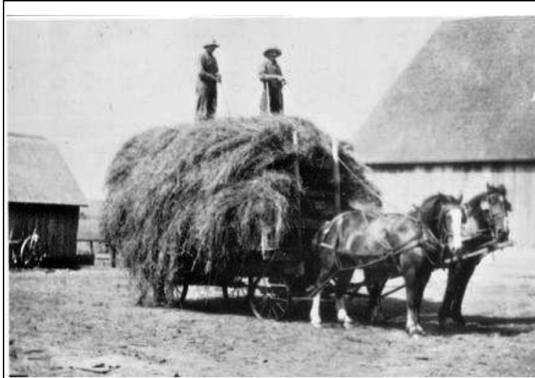
Haying on the McConnell Farm in the 1940s